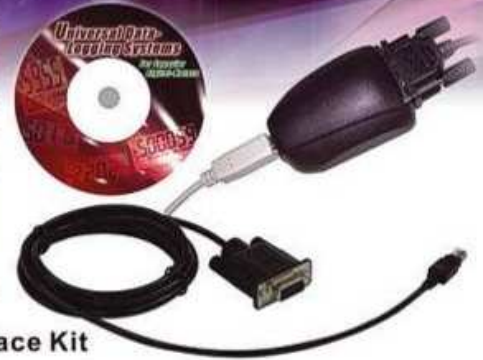
BRUA-13X PC Interface Kit (Optional Purchase)